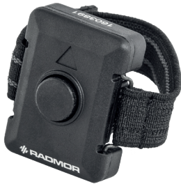
Wireless PTT button