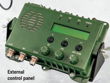
External control panel